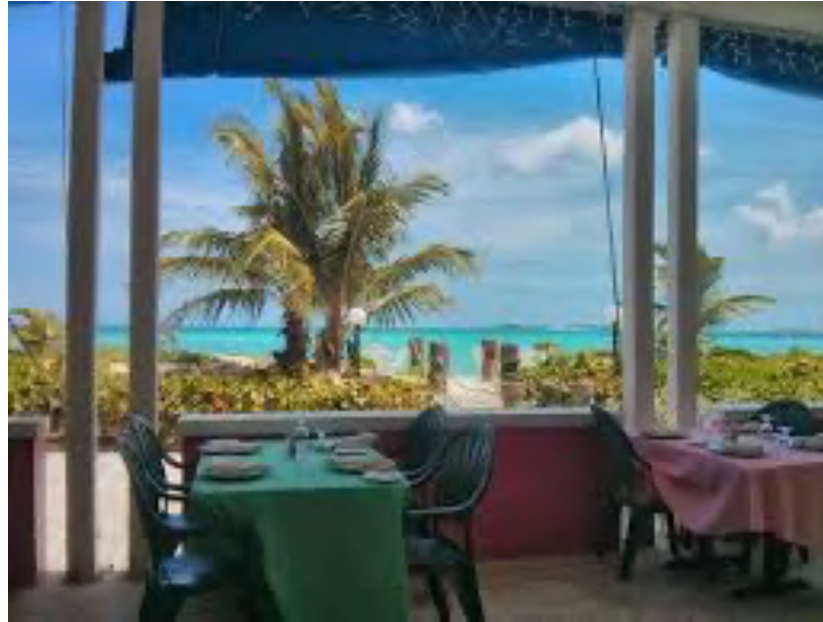
Outdoor Seating Steps away from beach