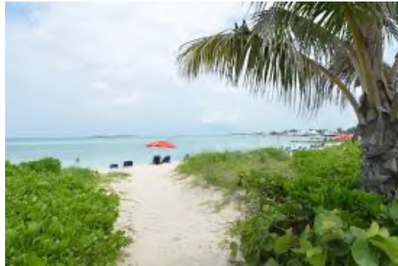
Beach Access from Beach Club