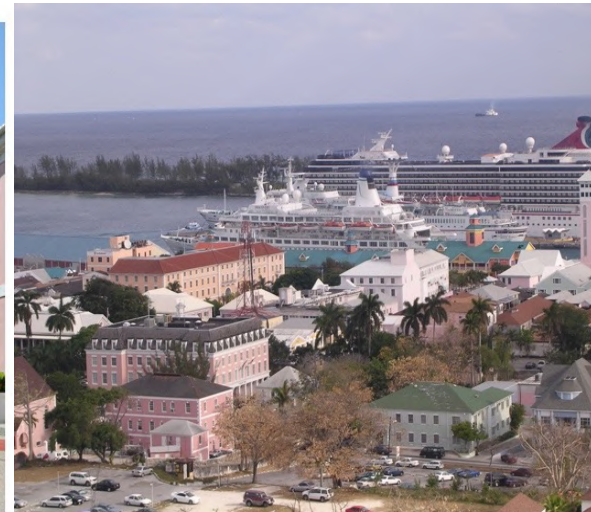
Overlook at Fort Fincastle