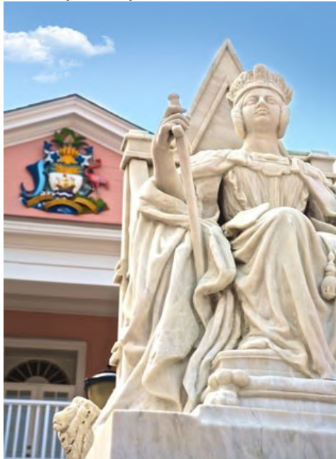
Queen Victoria Statue