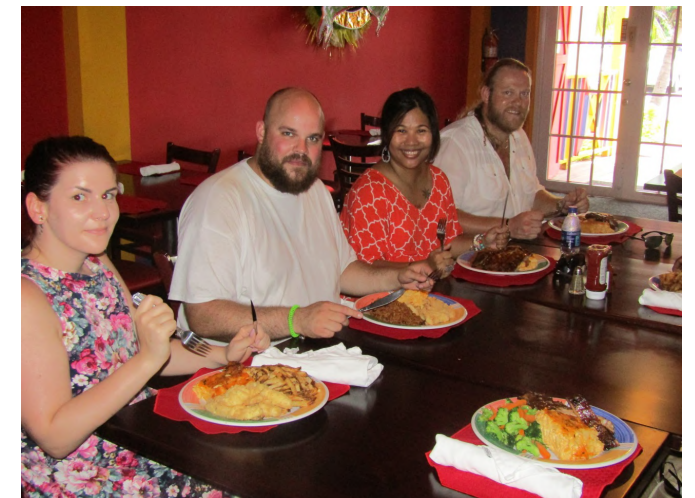
Bahama Grill Cafe