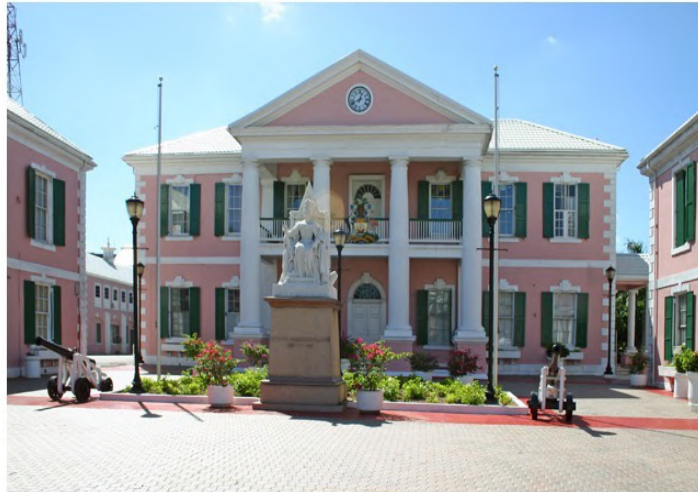
Rawson Square Parliament & Senate