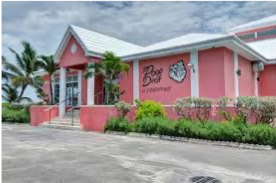
Beach Club Front View

Child - Chicken Fingers With French Fries & Served With A Fruit Punch Beverage