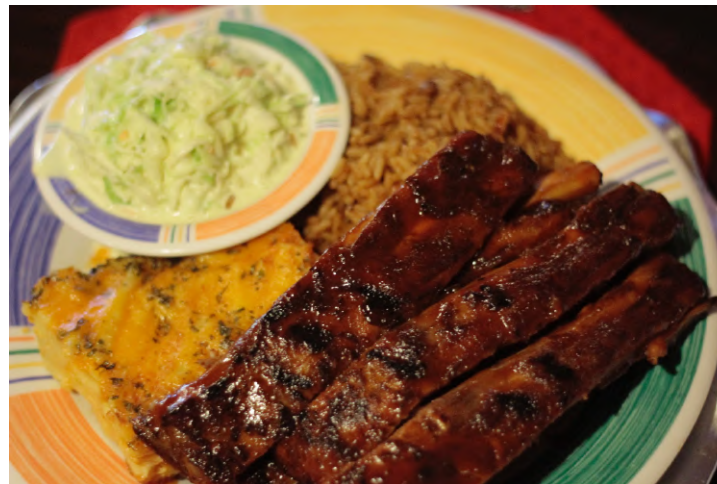
Bahamian Style Lunch